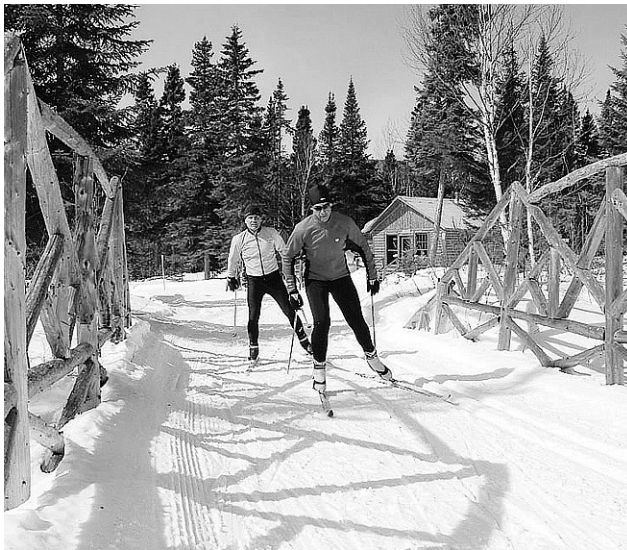
MONT GRAND-FONDS/TOURISME CHARLEVOIX

At Mont Grand-Fonds in Charlevoix, the cross-country trails have huts with wood-burning stoves and free refreshments situated every four kilometres.